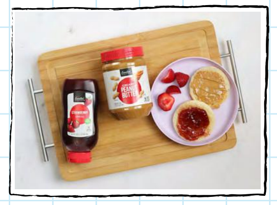
Go classic with PB&J. Try it on a bagel, rice cake or Evergreen Waffle for a fun update.