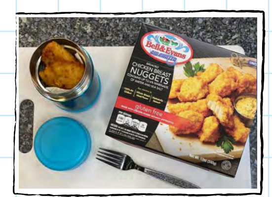
Send a thermos of Bell & Evans warm chicken nuggets. Add a dipping sauce, too!

Choose a Main Course The highlight of lunch should be a hearty protein so kids stay fueled for the day.