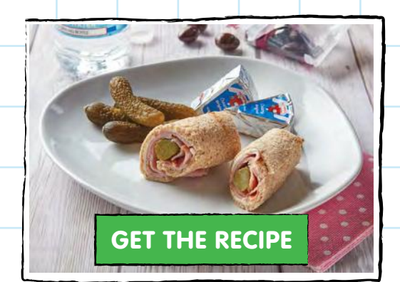
Your kids' favorite meats and cheeses make a fun finger food with extra crunch.